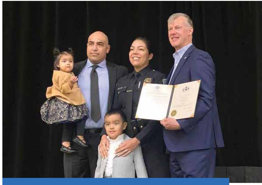
2022 RECIPIENT OF THE NEGOTIATIONS AWARD

This year's Crisis Negotiation Conference returns to Scottsdale on Nov. 13-16, 2023, at the Doubletree Resort by Hilton Paradise Valley-Scottsdale. We look forward to seeing you there, where we will continue providing first-class training for negotiators. Watch our website for the agenda and online registration information.