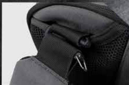
CONFIGURABLE SHOULDER STRAPS