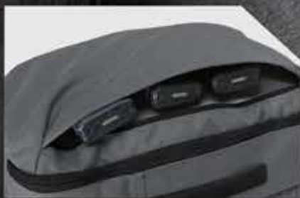
LOOP LINED POCKET