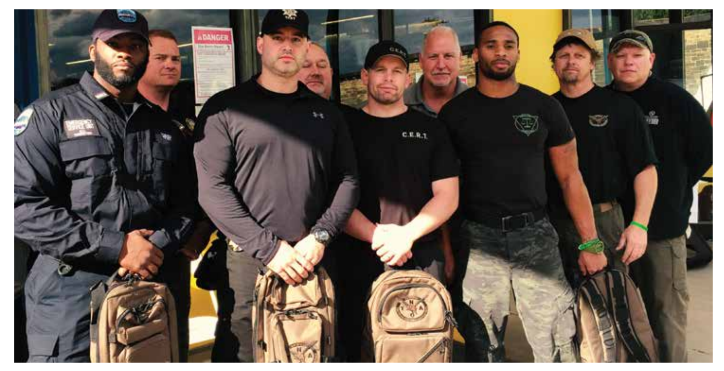
Participants and instructors for the Iron Operator Challenge.

the world as they engaged in the riot's scenarios, training and vendor demonstrations. For many, however, the highlight of the first official day was the return of the NTOA Iron Operator Challenge. Building off last year's tremendous success, NTOA trainers upped the ante by constructing a course that tested not only the officers' strength and endurance, but their sheer will to succeed.