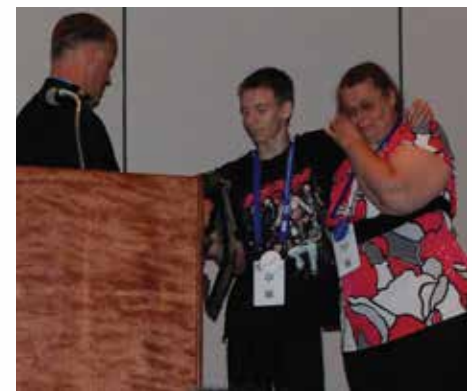
Families from Make-A-Wish Foundation

Our trade show, always a showcase for an amazing array of products and services, featured more than 230 companies. This year we introduced a Product Showcase featuring the Victory, a wireless rail-mounted push-to-talk communications system from Atlantic Signal; Syntech bullets, holsters and medic supplies from Vista Outdoors; the Streamlight TLR-6; a backpack-mounted OC spray system from Less Lethal Concepts; and the new