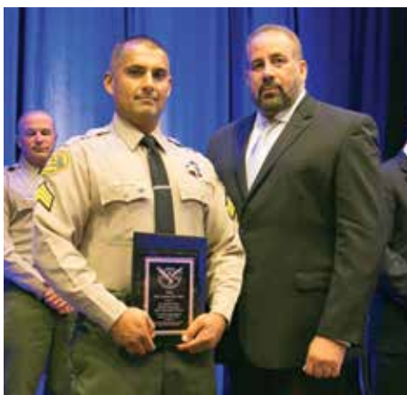
Unit Citation of Valor: Los Angeles County SD