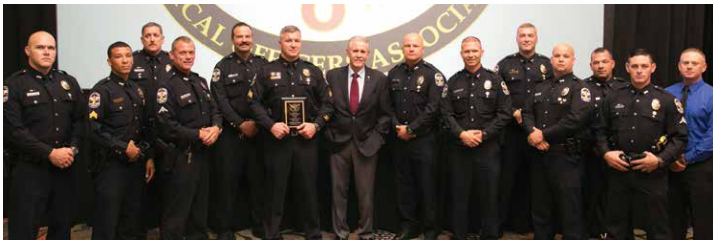
Conference Co-hosts Louisville Metro PD