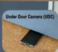
Under Door Camera (UDC)