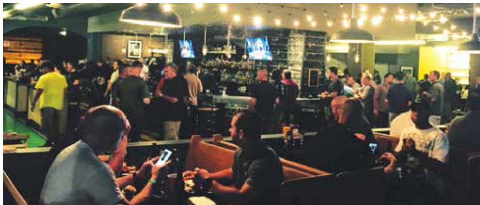
Welcome Reception at The Sports and Social Club, sponsored by Lenco, Point Blank Enterprises and Tactical Electronics