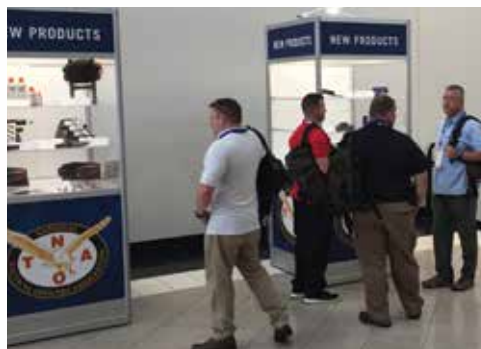
NEW Product Showcase