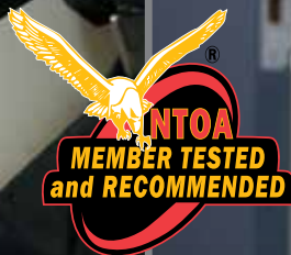
TACTICAL SEARCH POLE CAMERA (TSPC)