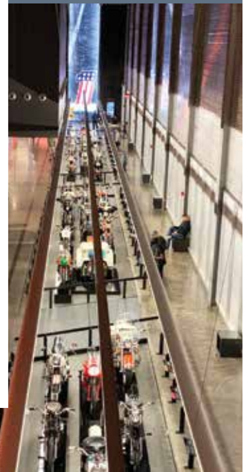
Welcome reception at the Harley-Davidson Museum.