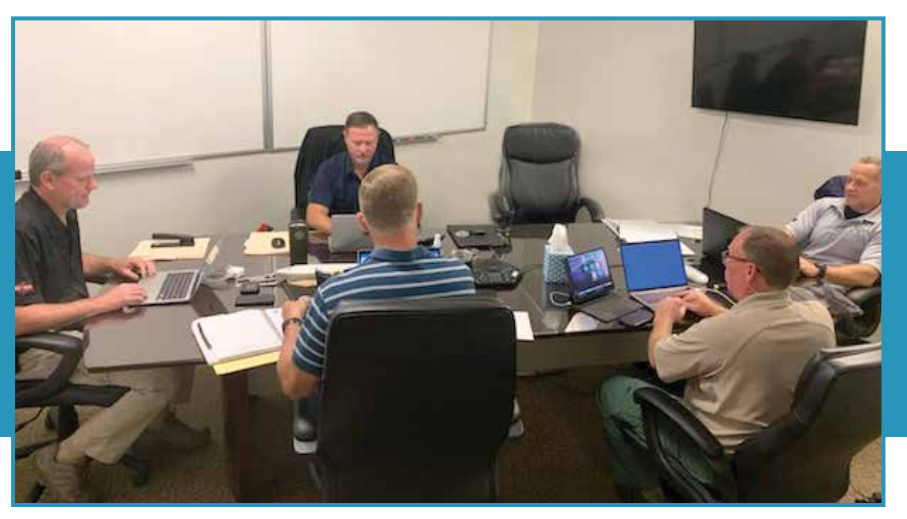
NTOA training team getting ready at headquarters in Colorado Springs to launch the virtual conference.

Environment," gave listeners a broad look at considerations for programs including selection, training, current legal aspects, and more for leading police sniper operations. The course prompted many great questions and interaction from the students.