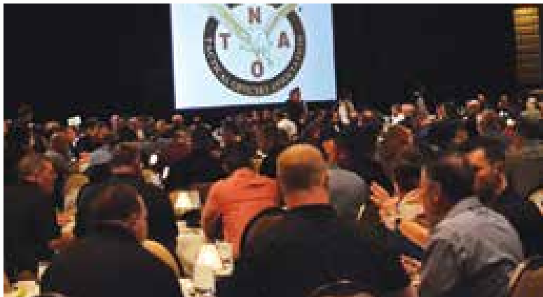
Awards ceremony and banquet

The annual presentation of the NTOA Awards recognized worthy individuals and significant achievements that have occurred throughout the