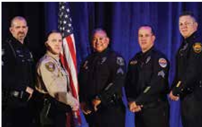
Arizona Tactical Officers Association