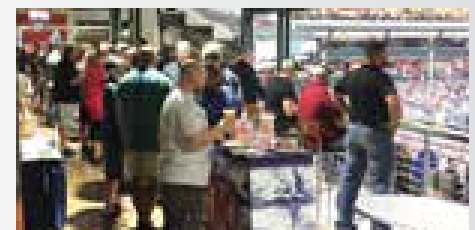
Arizona Diamondbacks game at Chase Field sponsored by Vista Outdoor