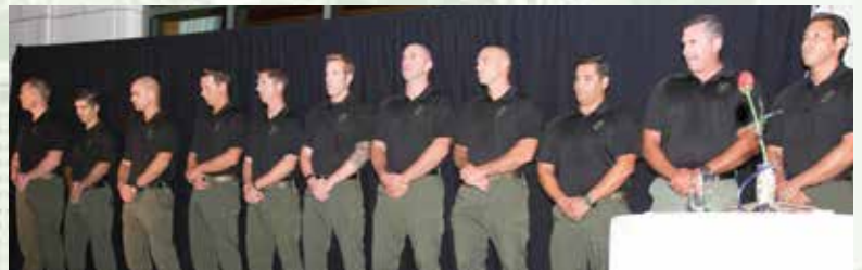
Unit Citation for Valor: Tri-City Regional SWAT Team