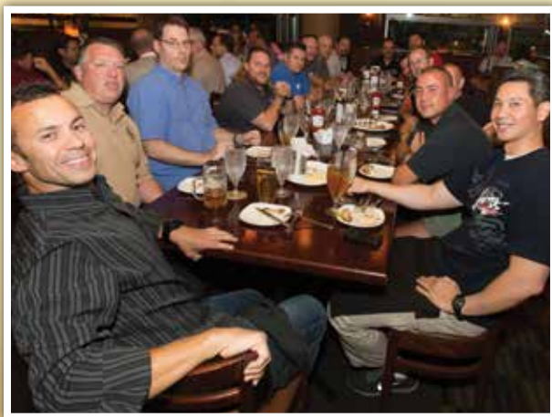
SWAT Call-Out Dinners