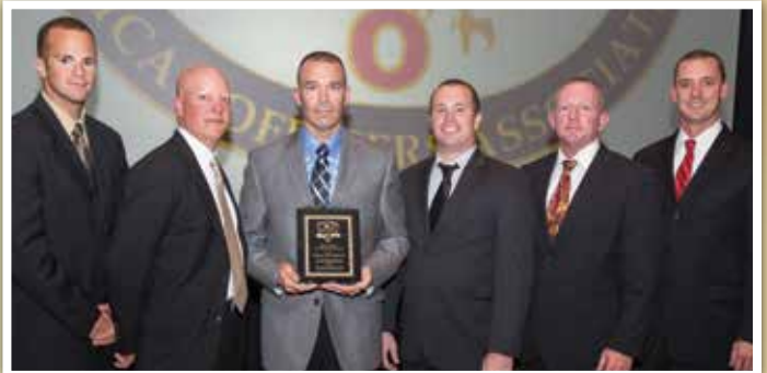
The NTOA Unit Citation of Valor: Presented to members of the Arlington (TX) PD