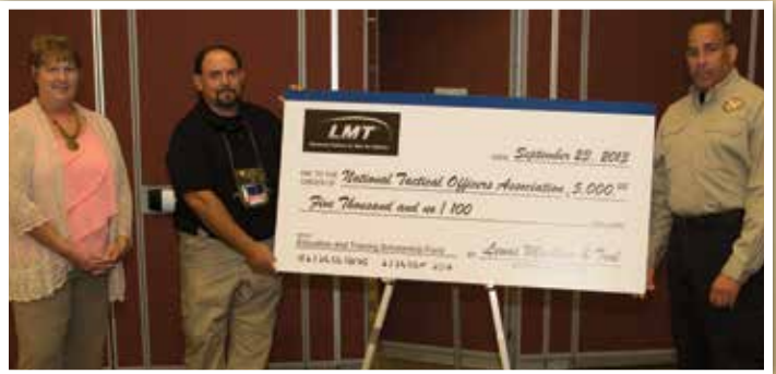
Lewis Machine and Tool donates $5,000 to the NTOA James Torkar Educational Scholarship Program and Tactical Conference Scholarships.