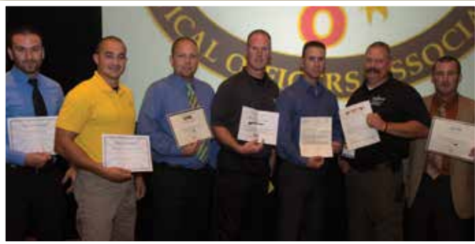
Firearms raffle winners. Sponsors: Lewis Machine and Tool, Gander Mountain Law Enforcement Division, CORE 15 Firearms and Mossberg.