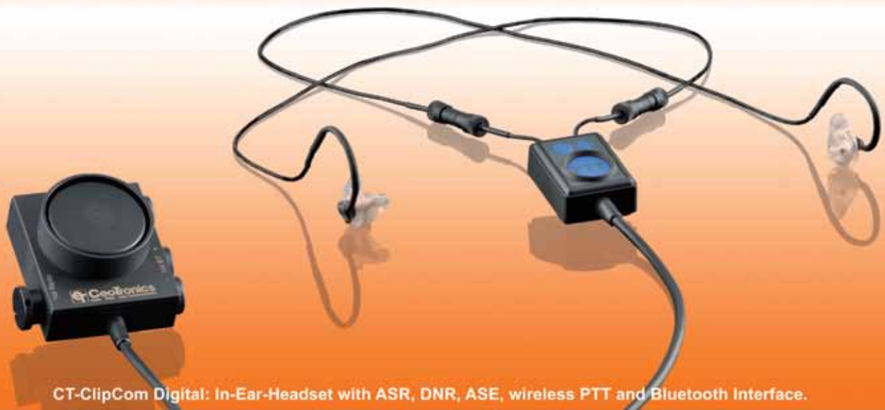
CT-ClipCom Digital: In-Ear-Headset with ASR, DNR, ASE, wireless PTT and Bluetooth Interface.

sales@ceotronicsusa.com • Toll Free: 1-877-523-7994